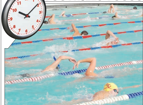
Falcons' eyeing ninth straight title. See page 8.