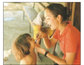
Students invited to participate in program.