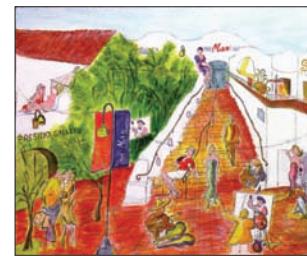
Foothills resident debuts Tucson Portfolio.